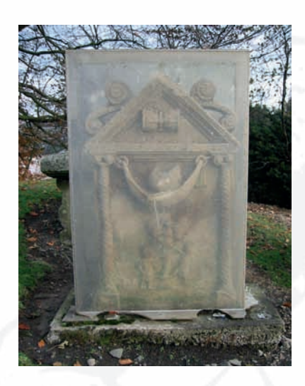
The stone when the project began

Gravestones depicting Adam and Eve were once common throughout the Lowlands of Scotland, but over the last 300 years numbers have dwindled. This is one of the earliest in Scotland and is the only known example in Peeblesshire. Probably carved by a local mason, the Lyne gravestone is a unique example of Scottish folk-art sculpture.